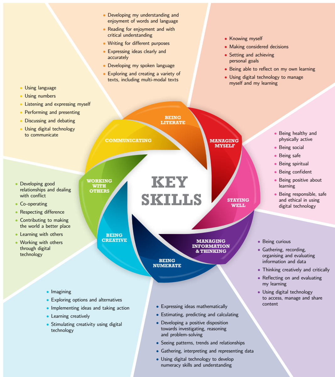
Figure 1: The elements of the eight key skills of junior cycle

In addition to their specific content and knowledge, the subjects and short courses of junior cycle provide students with opportunities to develop a range of key skills. Figure 1 below illustrates the key skills of junior cycle. There are opportunities to support all key skills in this course but some are particularly significant.