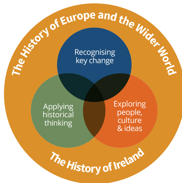
Figure 3: The elements of strands 2 and 3: The history of Ireland and The history of Europe and the wider world

There are three interrelated elements to strands 2 and 3: